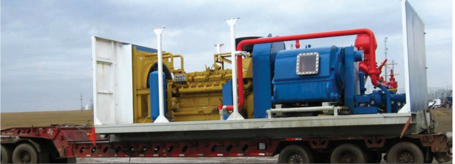
XL 100 Folding Gooseneck (Mechanical)