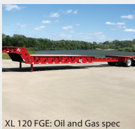
XL 120 FGE: Oil and Gas spec

XL Folding Gooseneck can be fully equipped for use in the oil field. With rollers including tail rolls, neck rolls, pop-up rollers and pick up eyes , the XL Folding Goosenecks easily accommodate your oil and gas hauling needs.