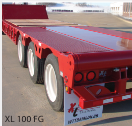
XL 100 FG

The XL Folding Gooseneck handles your heaviest hauling challenges. The low incline ramp makes it easy and safe to load and transport pavers, scrapers and other heavy equipment. The neck adjusts to uneven terrain without the use of blocks so you can load and unload almost anywhere.